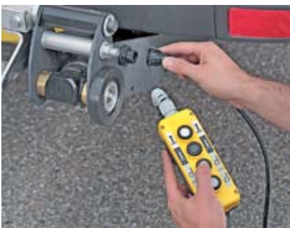
Emergency control unit.