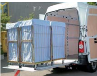
Standard: The trolley stop for 4 laundry trolleys or 1 foodstuffs trolley.