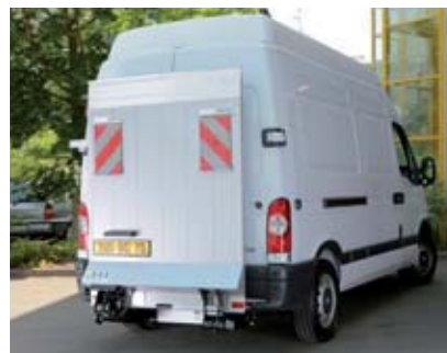
Bär VanLift Standard.