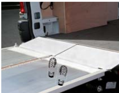
The two-part VanBridge connects the vehicle floor and the platform. Platform safety with TracGrip and SideGrip.