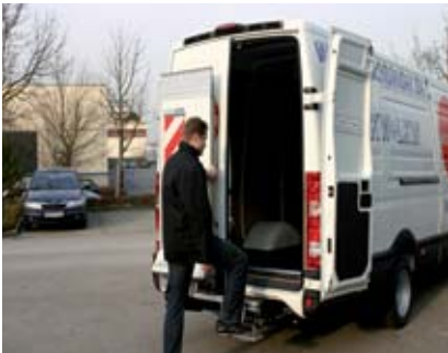
Free, safe access without moving the lift.