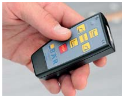
Intuitive : Radio-control unit with safety timer.