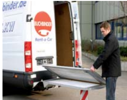
Open hydraulically and unfold by hand.