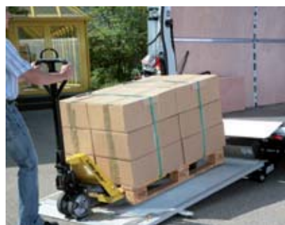
Enough room for euro pallets and lift trucks. Extremely low approach angle (6.2°). Please keep in mind pallet weight.